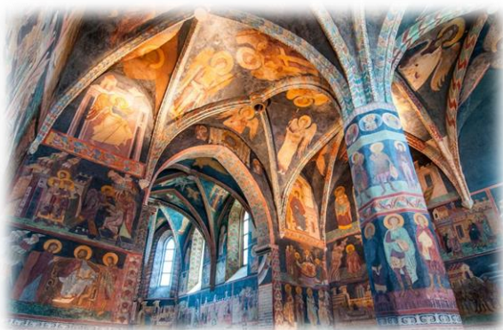
Chapel of the Holy Trinity

In the castle's courtyard is a chapel that would have been raised at the same time as the keep, and was then remodelled at the beginning of the 15th century at the behest of King Władysław Jagiełło.