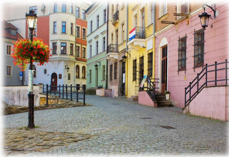
Old Town, Lublin

Between the castle in the north and the Rynek (Market Square) in the south, Lublin's Old Town is in a small but endearing package.