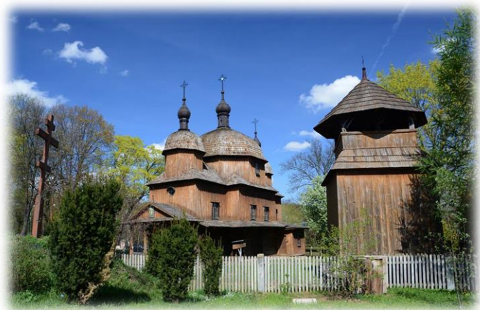
Lublin Village Museum

Based on the Swedish "Skansen" model this open air museum in the Sławinek District 15 minutes from the city centre is a living snapshot of historic rural life in the Lublin Province. The museum covers almost 30 hectares and gives you the sense of being in the countryside as you navigate lanes and paths between reconstructed thatched cottages, windmills and workshops from the 18th and 19th centuries.