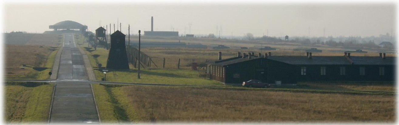
Majdanek State Museum

The mausoleum piled with ashes, and the gas chamber with a wall stained blue from Zyklon B gas are both as disturbing as you'd expect.