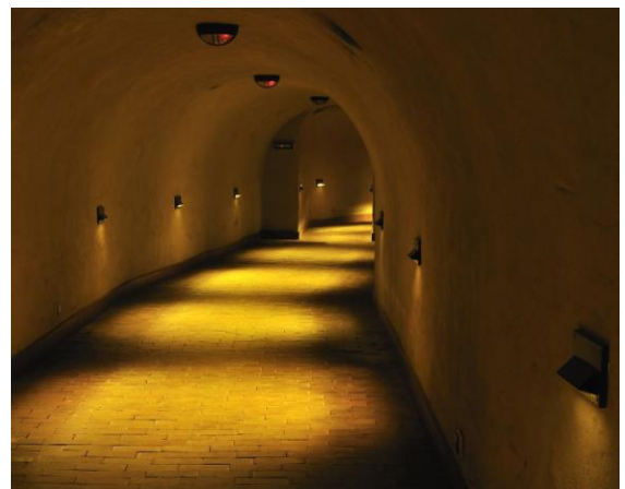
Lublin Underground Trail

After entering the dungeons at the Crown Tribunal you can set off on a Goonies-style adventure through the interlinked cellars of Lublin's 16th and 17th-century townhouses. The trail, set up in 2006, is almost 300 metres long and beckons you into 14 exhibition rooms. These have scale models showing Lublin's changing cityscape from the 700s to the end of